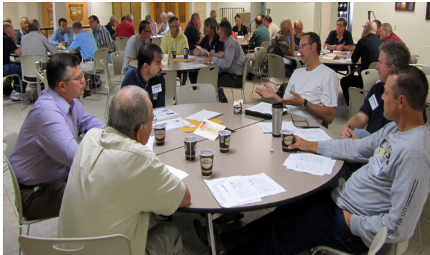
That Man is You participants discuss the presentation they have just heard.

After participating in the That Man is You program for two years at St. Columbkille Parish, I was convinced that we should introduce it at St. Anthony Parish, which we did in the summer and fall of 2011. Over 50 men registered, and the feedback has been very positive. Breakfast is served from 6:45 -7:15, fol-